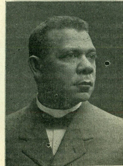
Prof. BOOKER T. WASHINGTON, L. L. D., Who delivered the address at the close of the State Summer School.