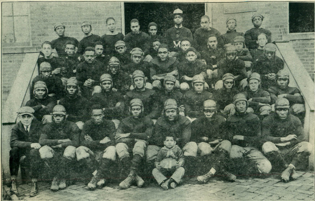
Football Squad of 1921