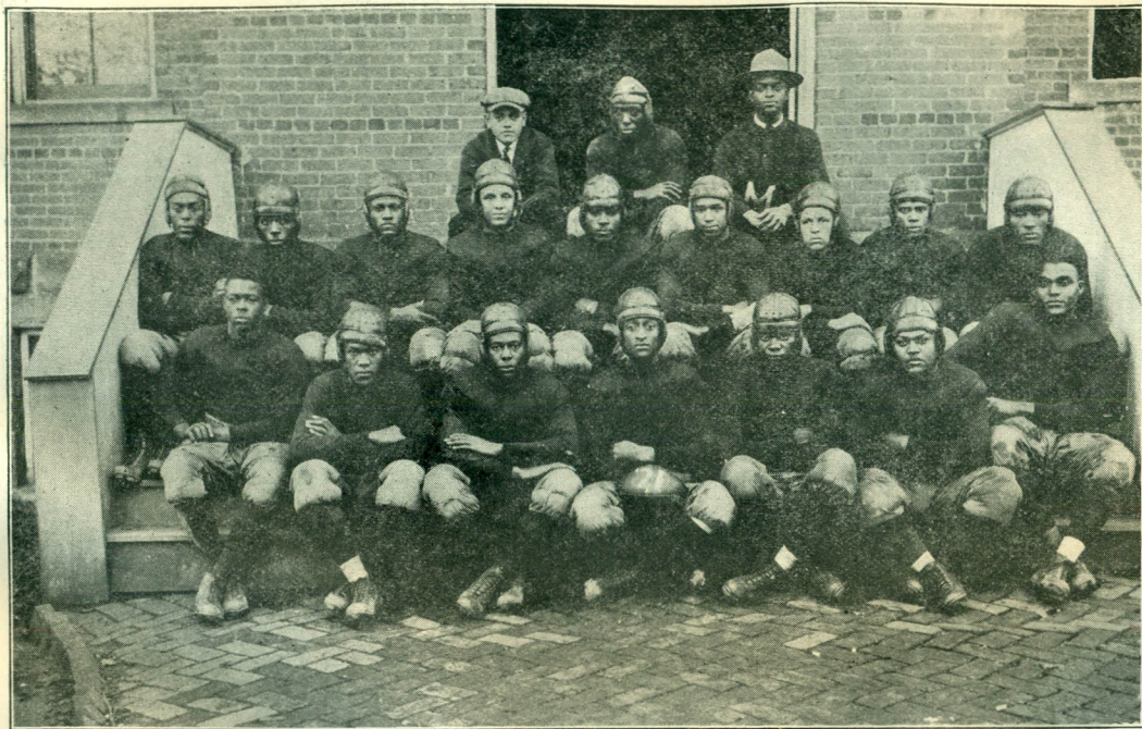
Varsity Team of 1921