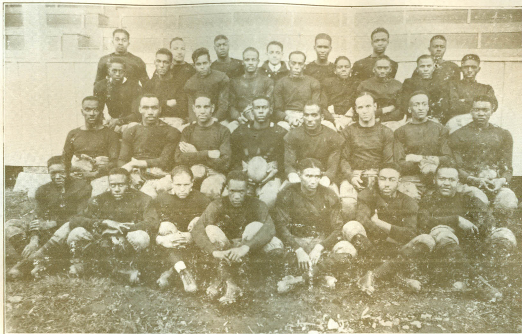
OUR CHAMPIONSHIP FOOTBALL TEAM—1922